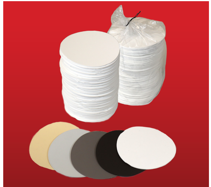
Colors Shown L-R: Tan, Gray, Slate Gray, Dark Bronze, White