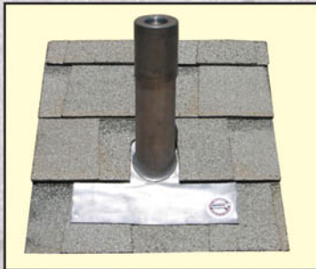
Cut to Pitch Lead Flashing Available with or without Cap. Shown with Cap.