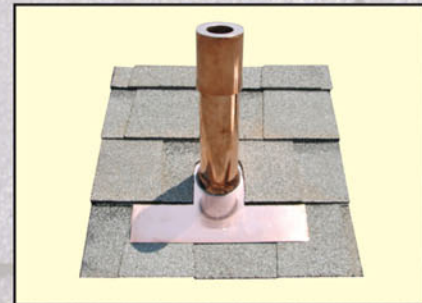
Cut to Pitch Copper Flashing with Cap.

All Flashings Available in Standard Base & Shake Base Lead Flashings Available in Adjustable or Cut to Pitch