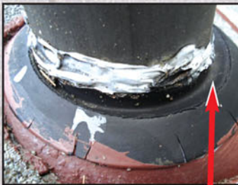
Failing No Caulk Flashing. No Caulk is No Good! Notice "moat" where water can puddle.